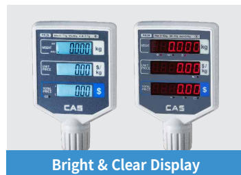
Bright & Clear Display