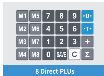
8 Direct PLUs