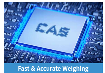
Fast & Accurate Weighing