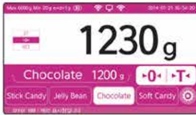
Simple weighing mode