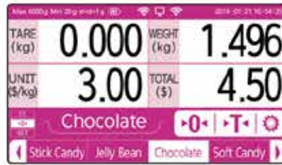
Price Computing mode