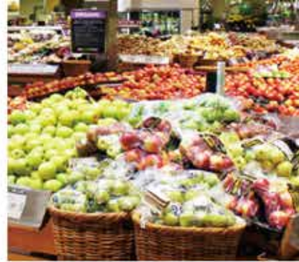
Commodity Name Display