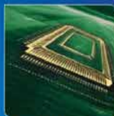
High weighing performance