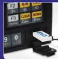
USB data backup