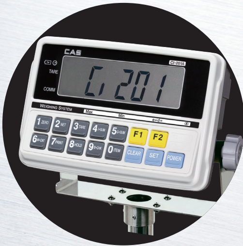
▲ CI-201A with optional pole bracket

Applicable for various weighing applications, with the added flexibility of manually setting functions via numeric keys. With various power supply options, the CI-200A series is highly portable and ideal for environments where power outlets are not available or power outages often occur. USB communication (with power) is adopted for various abilities.