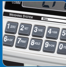
Numeric & function keys