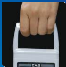
Anytime and anywhere