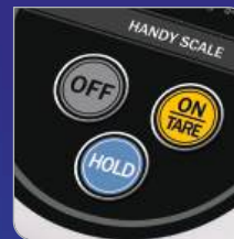
Simple and easy operation