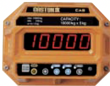
▲ Display & Keyboard