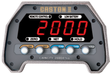
▲ Display & Key board