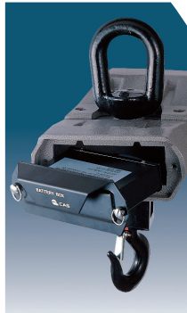
Battery Pack Installation ▶