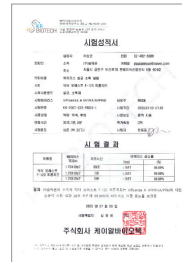
Certification for the efficiency of sterilizing swine flu by 99.98% within 30 seconds