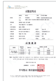
Certification for the efficiency of sterilizing COVID-19 by 99.99% within 30 seconds