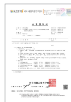
Skin irritation stability test report