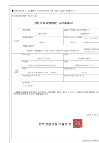
Certificate of conforming to safety standards