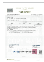
Acute oral toxicity test pass report