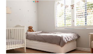
Indoor space (living room/ bed room)