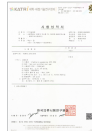
Certification for the efficiency of sterilizing pneumococcus by 99.9% within 30 seconds