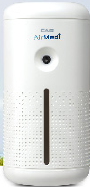
CAS Air Medi D5

Test institution: Laboratory specializing in virus inactivation, KR Biotech