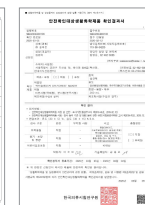
Verification report for safety standard and daily chemical products