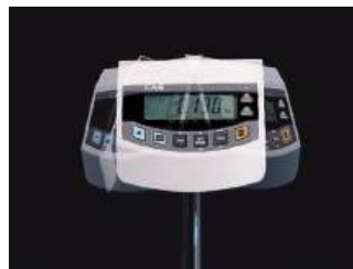
Turn left-right, 360° (Max.)