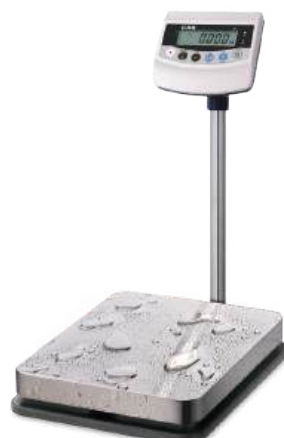
High cap. Platform