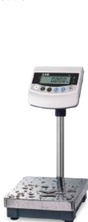
Low cap. Platform