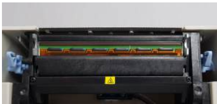
Stable TPH Design