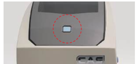
Simple to Use, One Button