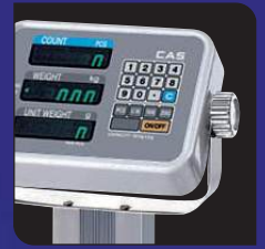
Pivot Type Indicator