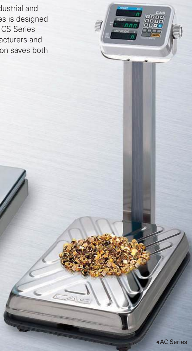
◀ AC Series