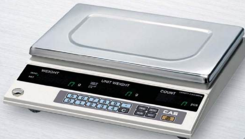
▲ CS Series