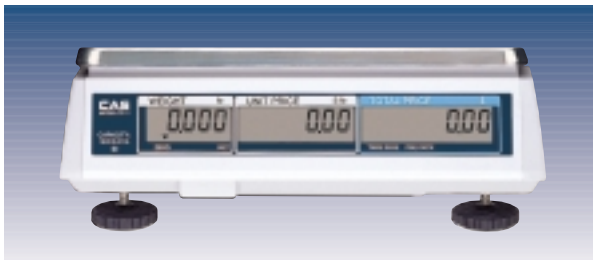
Display On The Rear Side