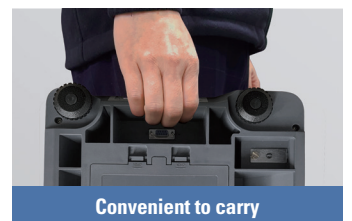
Convenient to carry