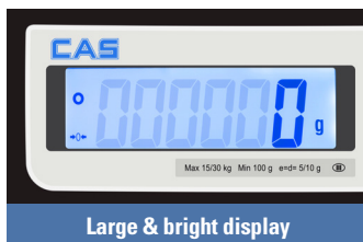
Large & bright display