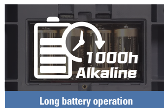
Long battery operation