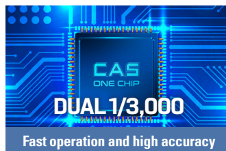
Fast operation and high accuracy