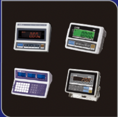
Connectivity with various CAS indicator