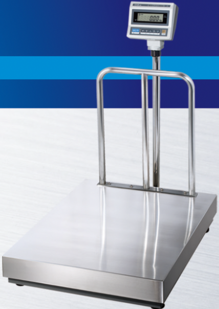
▲ ex) SPS connected with DBI indicator