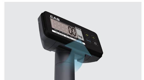
Adjustable view angle of indicator