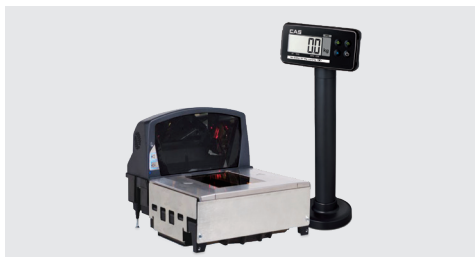
Connectable with various ECR system