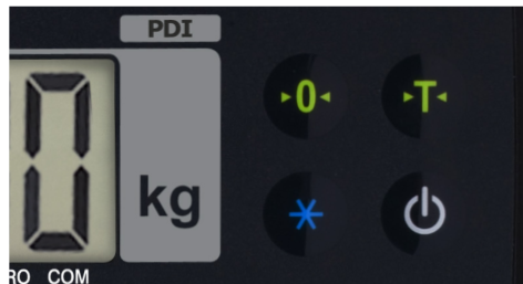
Easy to controll