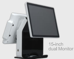
15-inch dual Monitor