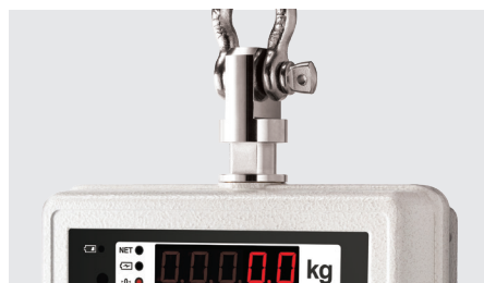
Lightweight & Robust enclosure