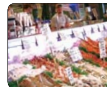
▲ Fish market