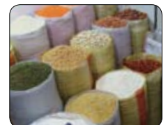
▲ Grain market