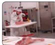
▲ Meat packing plant