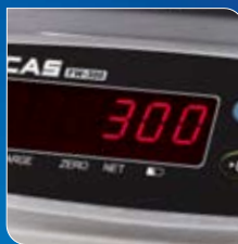
Clear and Highly legible LED display