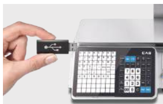
Firmware Update via USB Flash Drive