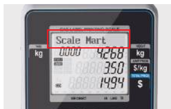
Scrolling Message Bar