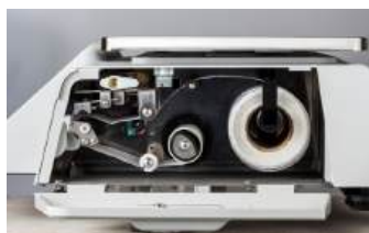
Optional Linerless Label Printing