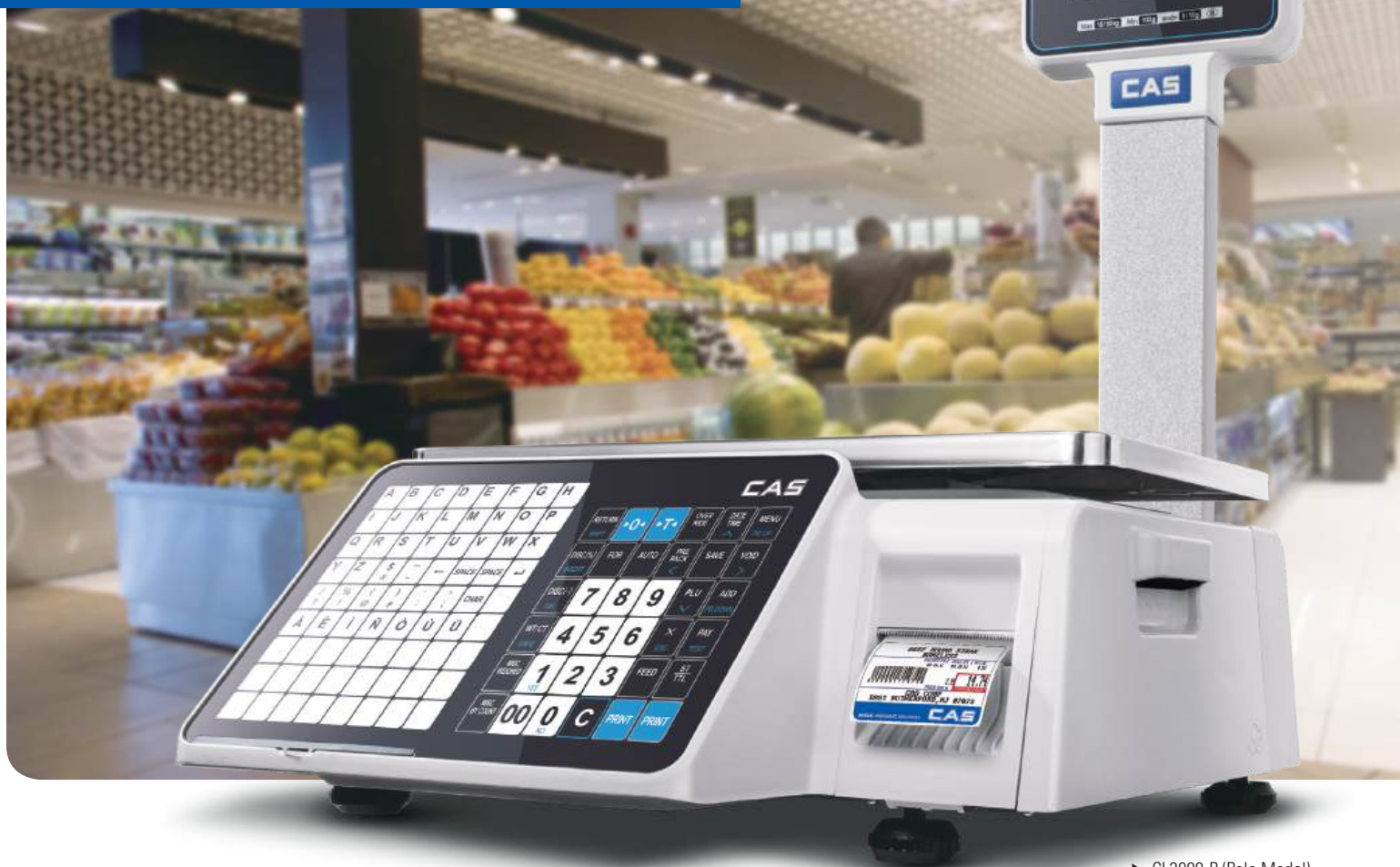
▶ CL3000-P (Pole Model)

The all new CL3000 Label Printing Scale.