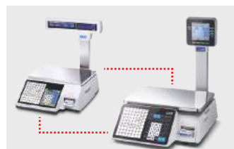
CL Series Compatible